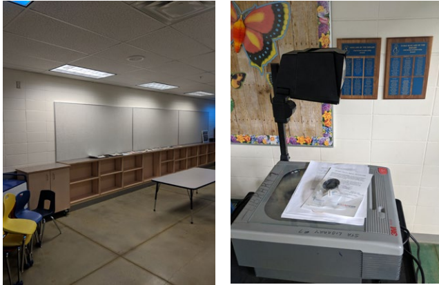
Selected room for deployment and location dosimeter 10-155-3912140B found

Dosimeter 10-155-39121139 was unrecoverable and missing. Dosimeter 10-155-3912140B, a QC blank was moved outside of sampling location on a projection cart with deployment placard.